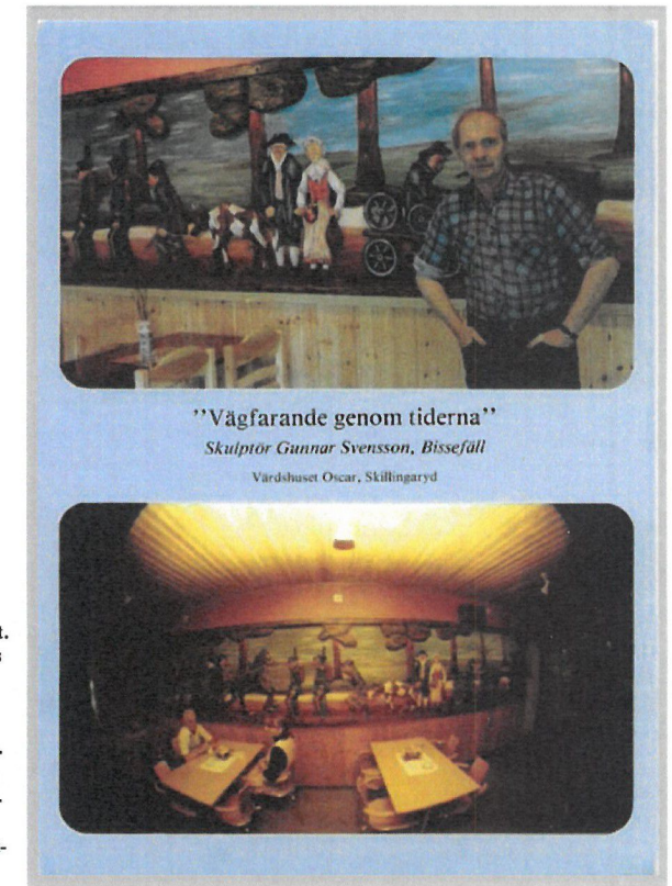
"Vägförande genom tiderna"