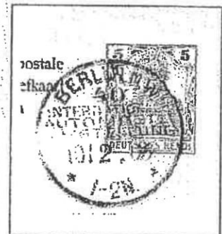
BACK OF POSTAL CARD Cancellation International Motor Show Berlin, February 10 1906