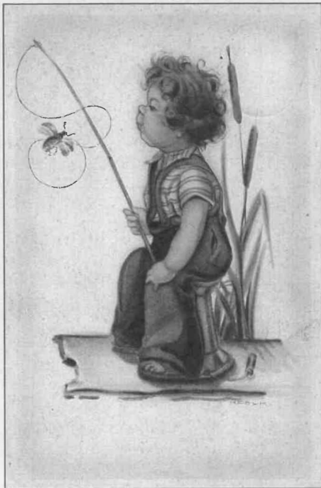
obieg poczt. 1938 r.

„Ludzie zaczynają wędkować, kiedy są tak młodzi, że z trudem mogą utrzymać kij w ręku i kończą, gdy są tak starzy, że ta sama trudność ich spotyka”.