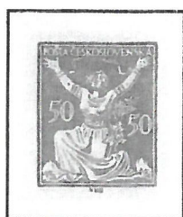
Chainbreaker 10 values Frames 1,2 & 3