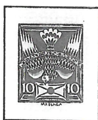
Dove 6 values Frames 4, part 5