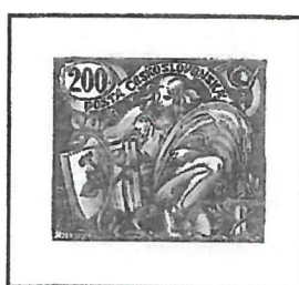
Agriculture & Science 1920 and 1923 9 values Frames part 5, 6, part 7