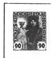
Hussite Priest 2 values Frame part 8