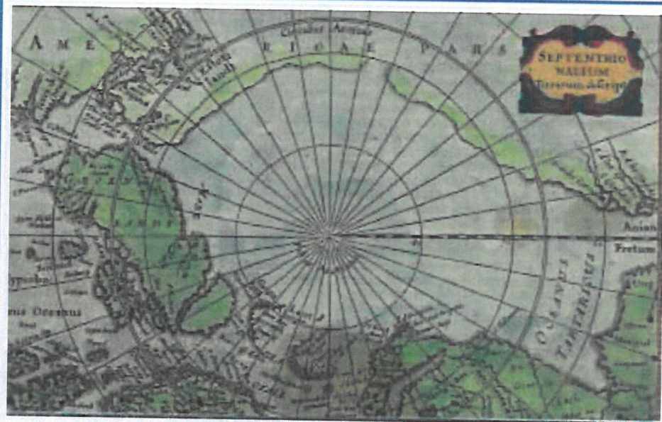
NORTH POLE MAP dated 1628