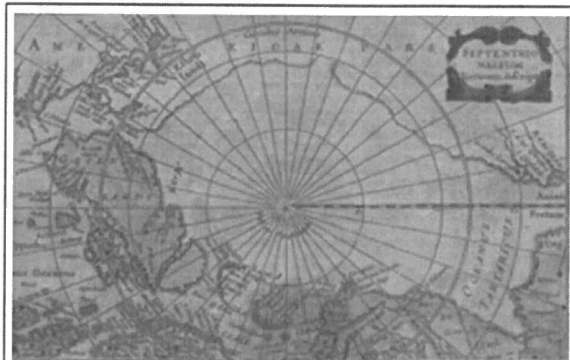
NORTH POLE MAP dated 1928