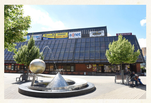
House of culture

Seat of the Liberec Region (in the foreground Lipo.ink - training and meetings rooms)