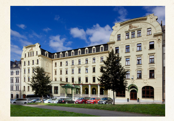
Clarion Grandhotel Zlatý Lev Liberec ****