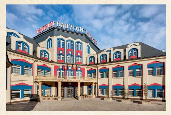
Wellness hotel Babylon ****